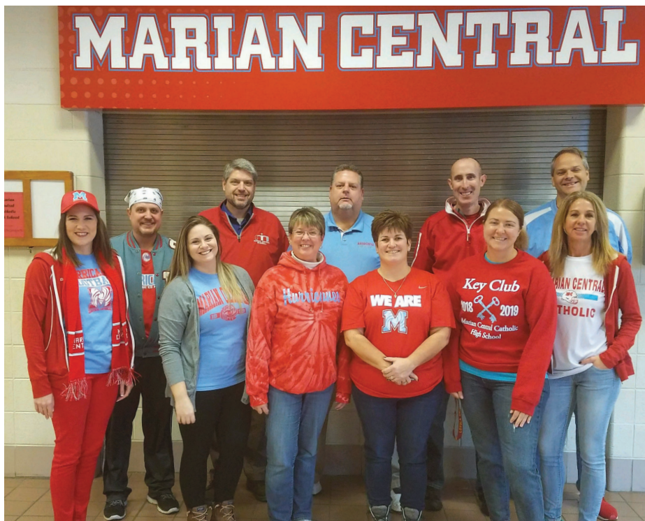
Current faculty and staff at Marian Central include 12 alumni.

If you are still interested in making a gift to Hurricane Day, text CaneDay to 52182 or visit www.marian.com/hurricaneday . Thank you for supporting our students!