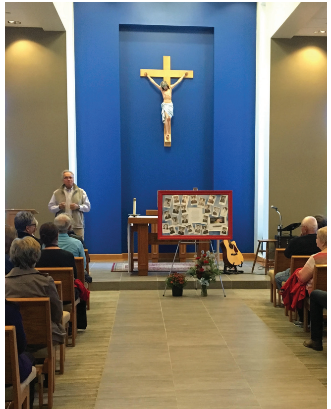
The Class of 1968 remembered their deceased classmates at a Memorial Service in the Marian Central Chapel.